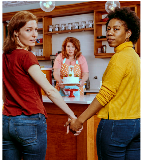
Cake - 2018