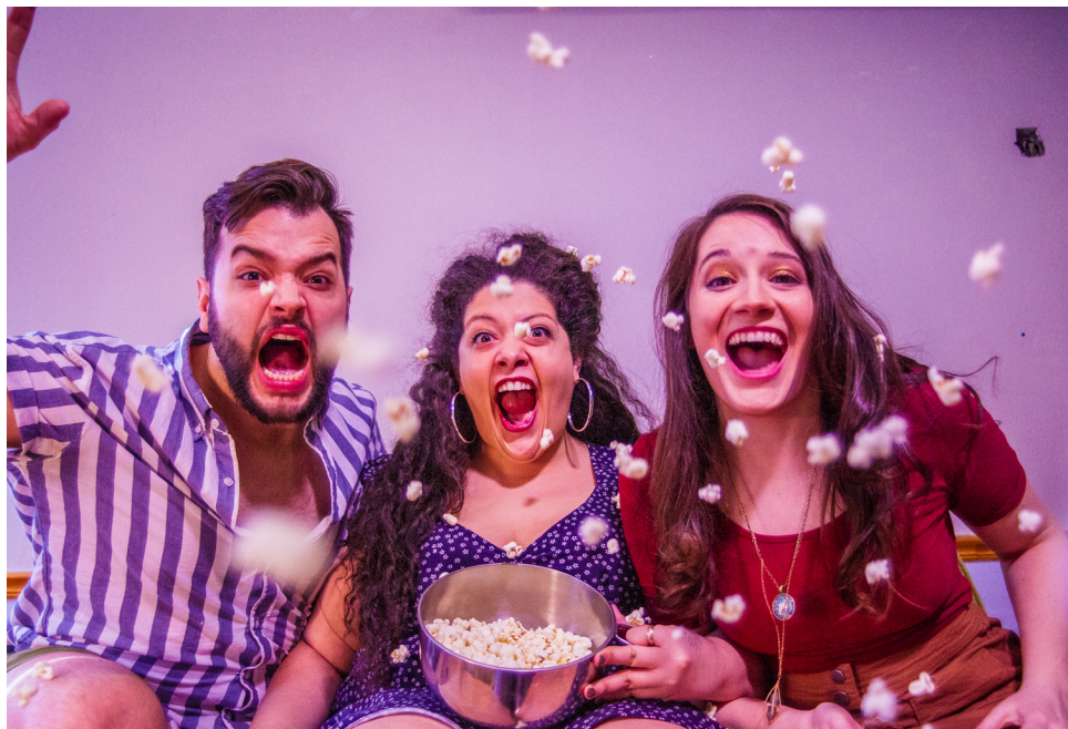
I Wanna F*cking Tear You Apart - 2019