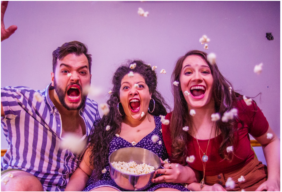
I Wanna F*cking Tear You Apart - 2019