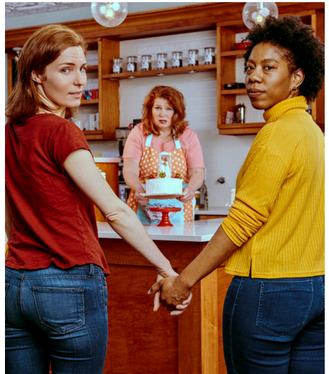
Cake - 2018